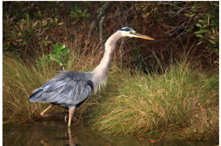
This Spectacular Great Blue Heron graces the Tinicum Wetlands with its' presence.

October brings transition and wonder. One day I wear shorts, and maybe a week later I need gloves to keep my fingers from numbing in the morning! While Hawk Mountain experiences a major migration spectacle not so far away, Tinicum's raptor sightings are no less exciting, as Coopers Hawk, Sharp-shinned Hawk, Peregrine, Merlin, American Kestrel, Red-tailed Hawk, and Bald Eagle are all seen during the Autumn months. With luck, you might even catch a Broad-winged or Red-shouldered Hawk soaring by.