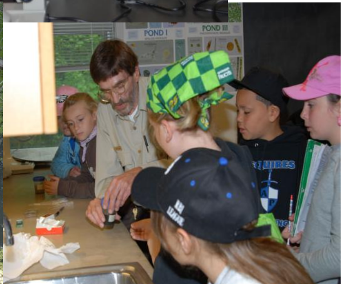
Students shown at all stages of Micro-Adventures.